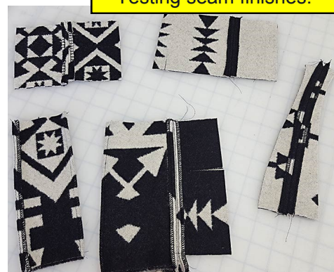
Testing seam finishes.