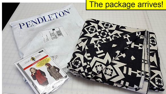
The package arrives!